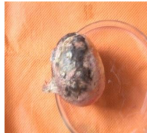
Plate-2: Fungal diversity on Onion bulbs